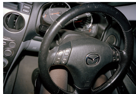
Drive 3 406 x 508mm C-type handprint Edition 3 +1AP $2600