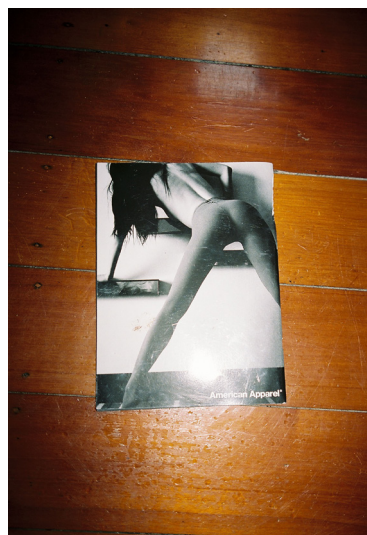
Immaculate smut C-type hand print 508 x 406mm Edition 3 + 1AP $2600