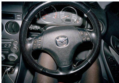
Drive 406 x 508mm C-type handprint Edition 1 +1AP $3000