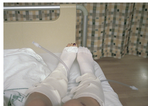
Frenzy 350 x 250mm Inkjet print Edition 1 + 1AP $2000