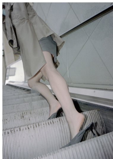
Overhang 842 x 1189mm Phototex Edition 3 + 1AP $1600